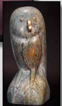
OWL , carved stone