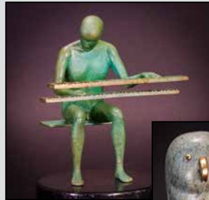
JAZZMAN , cast bronze.