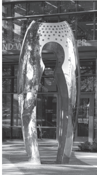
Living Vessel , 2010, stainless steel, glass and LED, 16', Eugene, Oregon.

A similar sculpture park is underway in Swe-