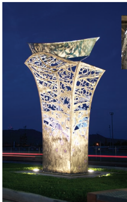
McKenzie Drift, 2010, stainless steel and glass, 17’, Springfield, OR. One of three sculptures varying in size from 16 to 30 feet built in the artist’s studio in Portland for Lane Transit District.

All that aside, I believe that America is by far the best place to be for sculptors doing public art. The great advantage that aspiring public artists have here is that anyone can win commissions if you have the wherewithal to go after them. Most public art commissions are driven by public fund expenditures and therefore managed with a relatively transparent process. Few artists know, for example, that all meetings conducted by state and most other public entities making decisions about public funds are open to the public by law—even the final selection