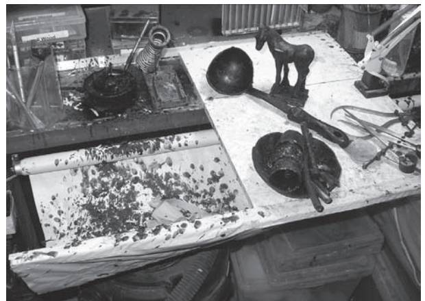
Above: wax worktable apron. Below: plaster worktable apron