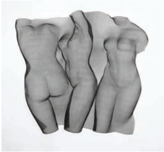
The Three Graces , 33" x 36" x 7", steel wire mesh

G rowing up in New York State with an art teacher for a Dad gave me almost unlimited access to art materials, ideas, and encouragement. Even in my youth, I would be thinking of that snow shovel or lawn