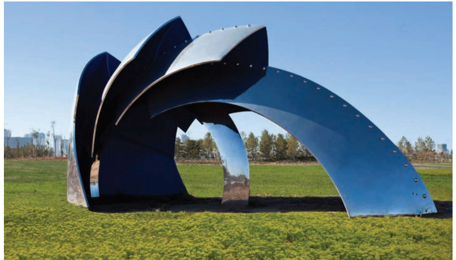
“Sunsight” 2009, stainless steel, 27’ Ordos, Inner Mongolia. Built for a new International Sculpture Park funded largely by wealth from coal mining.

Selection committees are not always made up of people who are experienced in looking at, evaluating, and making decisions about art. In fact, committees usually include one or two artists, curators, art historians or critics, and the rest are institutional representatives, architects, community members, stakeholders, public works staff, and so on. Art is subjective by nature, consensus is difficult to achieve, and when there is long and contentious debate, committees sometimes fall back on resume and reputation. Personalities and politics still play a part whenever