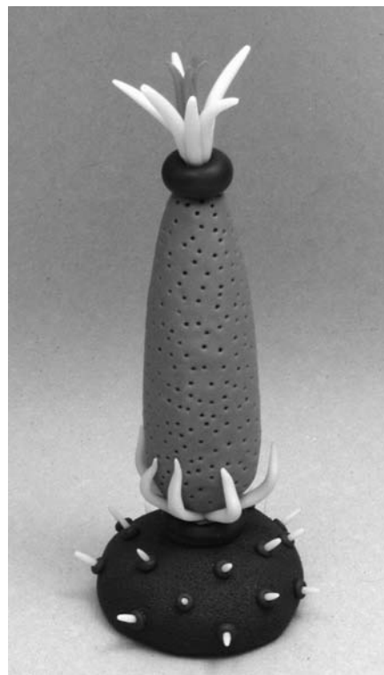
Hold a piece of foamcore behind and above your piece to create a background shadow.

In aperture priority mode, I can manually change the aperture and the shutter speed will compensate. With the lens wide open, I minimize the depth of field and allow as