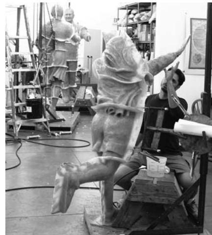
The final mold should be roughly 1/4" to 3/8" thick, which is typically three coats of approximately 1/8 inch.

All rubber molds need a mother mold to hold the rubber in shape. Mother molds can be made of plaster, fiberglass, and, more recently, an acrylic-based plaster called FORTON for a super lightweight mold.