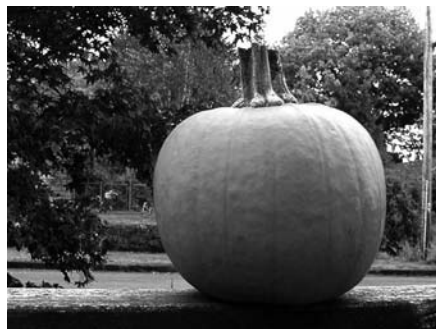
The pumpkin shown here was shot with the lens at maximum wide angle and a small aperture—F8 or so.