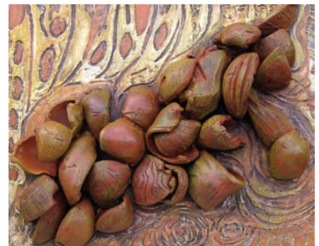
Remnants was made on “Sololit” at TONDACH.

I use them as metaphors for our planet earth and add pieces to them. These pieces are mostly discarded or broken objects whose usefulness has expired. They may reflect something else...maybe churches, buildings, suns, our industrial existence, people, activities....anything goes. Sometimes the piece is funny, sometimes not.