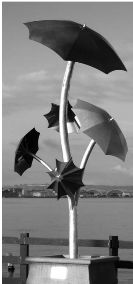
Sprouted Bumbershoot along the San Diego Bay.

By far our largest work to date at 18 feet, we hired out the bending of the 6-inch pole and had it galvanized for rust prevention. One of the most fun parts was playing with color: combining tinted clear powder coat hues to achieve eye-catching transparency and a delicious lollypop look. We chose aluminum for the umbrellas to keep the