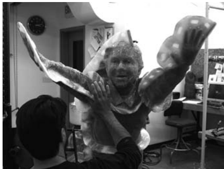
An artist creates flanges in the mold, creating the panels that will be cast separately.

Today there are a variety of rubber mold compounds available that are designed for reproducing sculpture. Some mold materials will last years in storage while others only months. It is now possible to produce hundreds of reproductions with no loss in quality. At considerable expense, there are formulas that require exact measuring, mixing and vacuum degassing. These compounds are really for the professional mold maker, who is making molds everyday. There are compounds for specific uses like fiberglass, cast stone and epoxy. Sculptors publishing bronze sculpture will produce molds designed for wax casting.