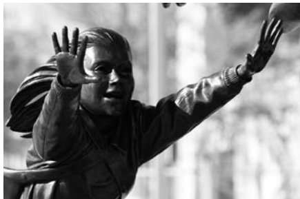
Life-size bronze sculpture, originally created in oil-based clay.

In 1933, the first rubber mold materials became available for the purpose of making multiple copies of sculpture. Before 1933, artists were resigned to making molds from plaster, which were complicated and of limited life, not to mention the fact that the reproductions were not that great. Plaster molds were notorious for degrading after each successive copy was made. This gave rise to the promotion of small limited editions by the art dealers of the day. The obvious difference in quality from the number one reproduction to the number eight reproduction, for example, gave extra value to early edition numbers with collectors. These preferences still exist today even though the whole reproduction process has changed.