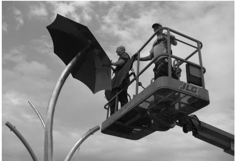
Dave Frei installing Sprouted Bumbershoot with crew help from Port of San Diego.