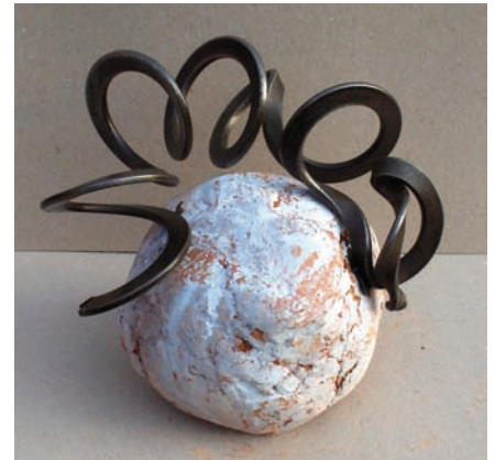
Relique #50, one of the “Planet Earth” series

I began gathering these “balls,” taking them to the driers and then hauling them to my studio where I put engobes on them. Then I took them to the kilns for firing. Why? Because I thought they were beautiful.