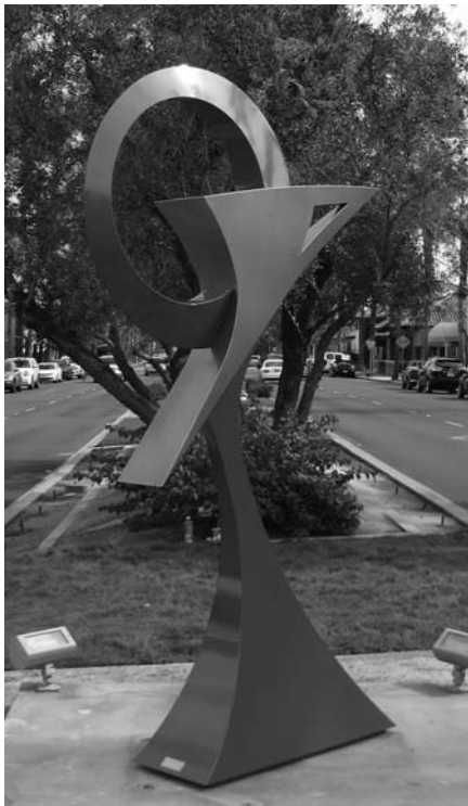
Shapely Two newly installed in Palm Desert, CA

When I saw the call I immediately had a vision of an umbrella tree and did a rough sketch on the spot. I guess you could say I'm on an umbrella kick because at that time we were working on a sculpture of a woman carrying an umbrella. It's such a fine form—fun...and relevant to the Northwest. But sunny San Diego? I've always wondered what it would be like to live in a place where it hardly ever rains. It sounds alluring, but admittedly I know I'd miss the rain. If this tree existed in nature, it would definitely be native to our area. When in San Diego, though, it would be an exotic species, and I hope San Diegan's can appreciate its whimsy.