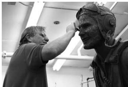
Use a painter's palette knife to carefully spread the rubber over the surface.

Water-based clays need to be dry, well sealed with a lacquer, and greased.