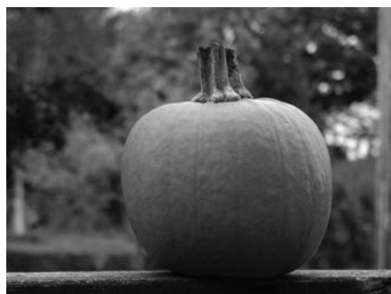
This one was shot in aperture priority mode at a setting of F2.8 and the lens at maximum telephoto. You can see how the background is much less distracting.