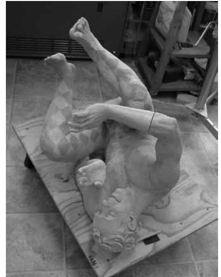
Checking fit before cold-welding (epoxy).