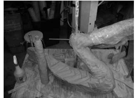
First "coil" along back and right leg.

me.com/pathaase. For more information on "Art in the Park," go to http://www.monarchartcenter.org/ . Artists interested in participating may contact myrna@monarchartcenter.org or call 360-264-2408.