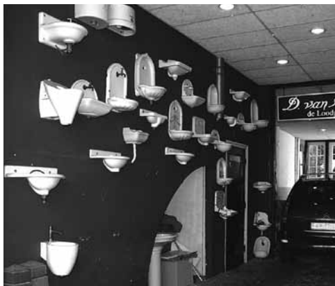
Duchamp Redux? Urinals on display at the entrance to a Dutch plumbing fixture store.

Despite its name, the 2010 London conference of the International Sculpture Center (ISC) was its first outside North America. The conference theme posed the question, “What is Sculpture in the 21st Century?” The consensus emerging from the keynote speakers and panelists is that the absorption of ephemeral activities into the category of sculpture that occurred in the last four decades of the 20th century shows no signs of abating. Video, performance, architectural inventions, social transactions, landscaping, sound installations and beams of light apparently have gathered under the rubric of Sculpture as opposed to attaching themselves to, say, Painting, Photography and Theater. A few speakers mentioned Marcel Duchamp as a key figure in this breakdown of the wall between art and life, with his attitude that art can be made from utterly mundane materials such as chocolate,