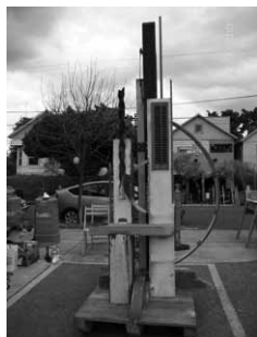
Symphony of ReUse on display at The ReBuilding Center Benefit