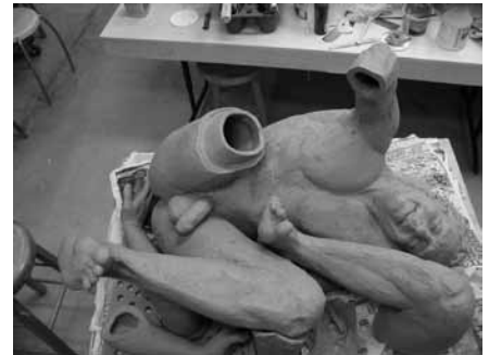
9 weeks later, ready to dry, then slide into kiln.