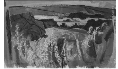
Examples of Carl Hall's landscapes: Columbia Gorge (above) and Endless Currents.

aspect that shows through in the work more so than in work produced elsewhere. I am talking about the artists in the Northwest who really consider themselves regional. There are many important artists working in the big cities of the area who seem more international, whose subjects are civilization and the psychology of modern life. Though the psychological and sociological backdrop is always present, it is less important when viewing the awe-inspiring portraits of wild nature that Carl Hall and Hilda and Carl Morris have given us. Human concerns—the ego included—fade in significance.