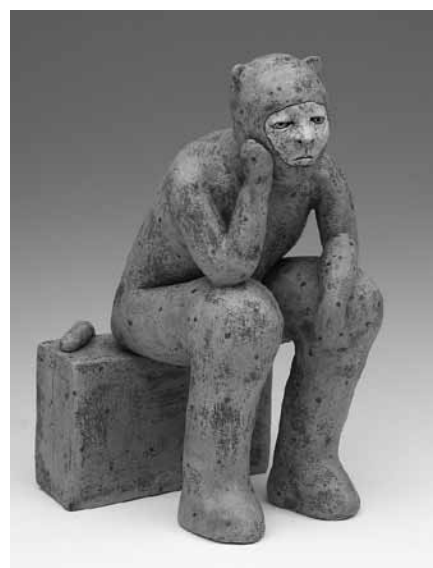
Waiting , ceramic, 15" x 9" x 10" by Sara Swink

Hanson Howard Gallery is located at 82 North Main Street in Ashland. (541) 488-2562; www.hansonhowardgallery.com .