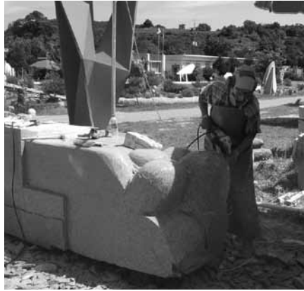
Carole Turner carves Together , at the 6th International Contemporary Sculpture Symposium in Korea.