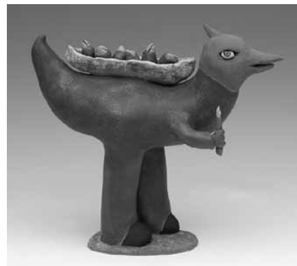
Peace March , ceramic, 11" x 11.5" x 5" by Sara Swink