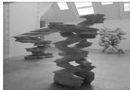
Organic, yet unearthly Tony Cragg's work at the Lisson Gallery.

All during the conference attendees could present their work in 10-minute time slots at “Art Slams.” There I saw grad students and established artists alike who relish working with their hands in traditional media such as metal, plaster, clay and wood. Many are also experimenting with digital processes to streamline tedious tasks or generate new forms. An outstanding example of the latter was the Tony Cragg organic yet unearthly sculptures, which I saw before the conference at London's Lisson Gallery.