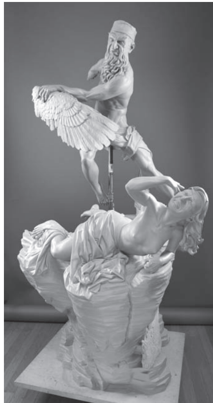
That 9/11 thing that happened , 5'x3'x3', oil clay, to be bronzed, by Rick Moore

The 9/11 sculpture is simply an observation of what happened on that terrible day. I'm not trying to pass judgment one way or another, although I do believe that killing innocent people in the name of religion (any religion) is something that should never be done.