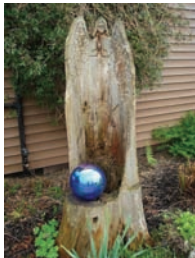
The Angel Miriam stands 5 feet high, made from a cedar stump.