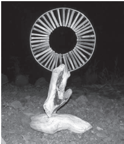
Full Flight stands about 2 feet, made from driftwood and copper and also was displayed at the Master Class Show in St. Petersburg.

You can see Richard's work at Drifting Images, http://www.driftingimages.com