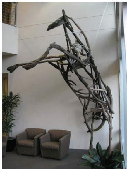
Untamed stands about 15 feet, made from driftwood.