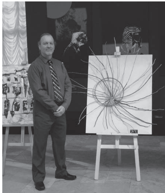
Full Spin is about 4 feet wide, made from driftwood and copper, I made a similar piece at St. Petersburg during the show.