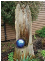
The Angel Miriam stands 5 feet high, made from a cedar stump.