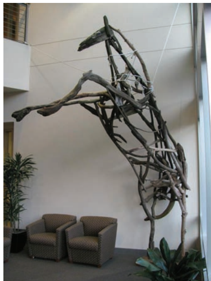
Untamed stands about 15 feet, made from driftwood.