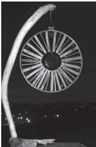
Blue Moon stands 4 feet high, made from driftwood, sea glass and blown glass, and copper, it was one of the pieces displayed in St. Petersburg, Russia.