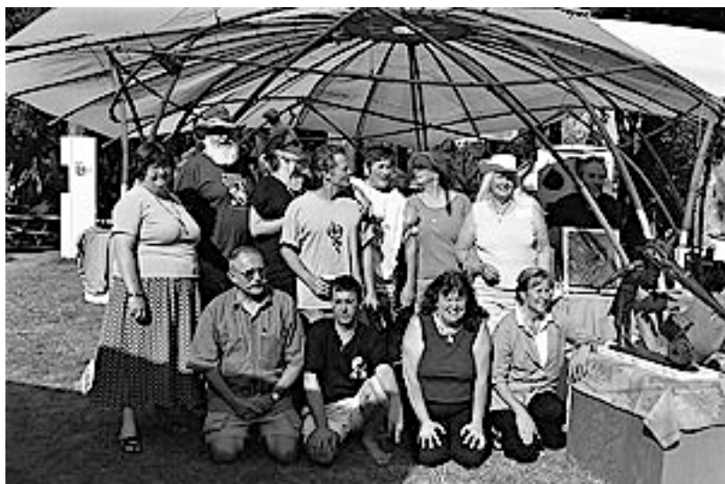
PNS participants of the 2005 Maryhill Festival of the Arts