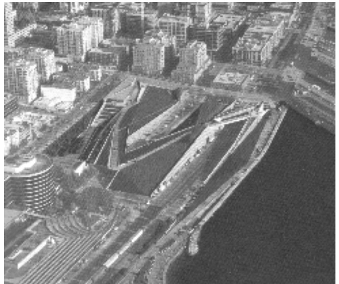
Olympic Sculpture Park in Seattle WA.

Sculptures include works by Anthony Caro, Richard Serra, Alexander Calder, Louise Bourgeois and Mark Di Suvero.