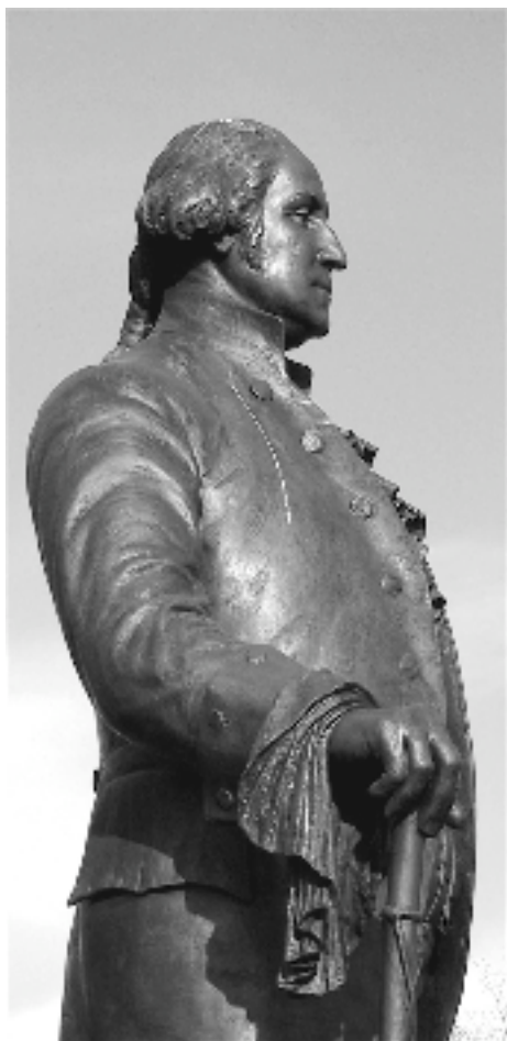
George Washington. Monumental figure by P. Coppini. Cast by the Roman Bronze Works, N.Y.. Dedicated in 1926 to the citizens of Portland Or. Sculpture located at NE 57 and Sandy Blvd.