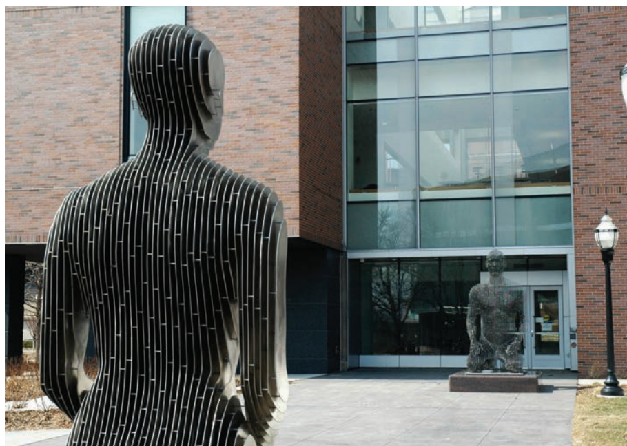
Views of Voss-Andreae's Spannungsfeld express the duality in the conceptual framework of the piece.

Inspired by quantum physics, the artist's professional background, Voss-Andreae developed an approach that transforms the human figure into a large number of vertically arranged, parallel steel slices with constant spacing. This style creates the impression of a three-dimensional topological map, evoking the fundamental scientific act of measuring the world. The visual effect this style produces is striking and echoes