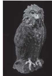
The Golden Eagle , ceramic, 5" x 3" x 2.5"