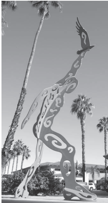
Taking Flight by Alisa Looney

Alisa Looney is honored to announce that her sculpture Taking Flight is one of three outdoor sculptures selected from 18 sculptures in the 2013/2014 El Paseo Invitational Exhibition to take part in the Palm Desert Public Art Contest. The public is invited to vote for their favorite sculpture, and the city will purchase the winning sculpture. The contest ends on July 31, 2014. Visit this link to participate: http://www.palm-desert.org/arts-culture/public-art/public-art-contest